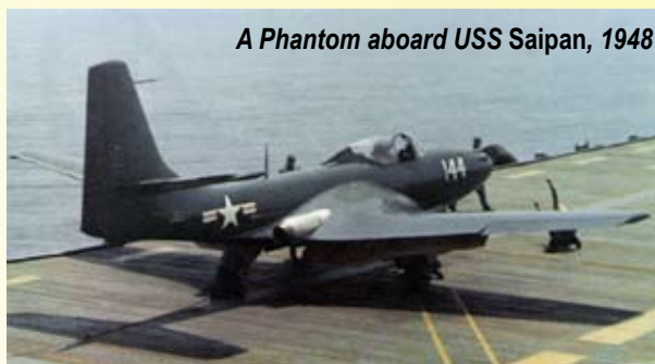
A Phantom aboard USS Saipan, 1948

Answer: McDonnell FH Phantom, which completed four successful takeoffs and landings on July 21, 1946, from USS Franklin D. Roosevelt near Norfolk, Virginia. At the time, Roosevelt was the largest carrier serving with the US Navy, allowing the aircraft to take off without assistance from a catapult.