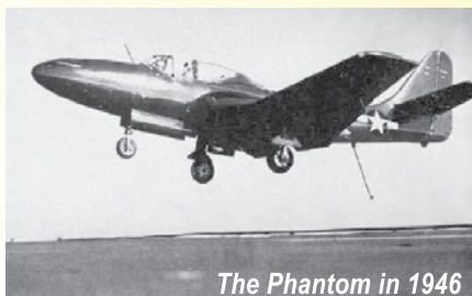
The Phantom in 1946