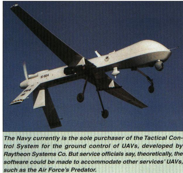
The Navy currently is the sole purchaser of the Tactical Control System for the ground control of UAVs, developed by Raytheon Systems Co. But service officials say, theoretically, the software could be made to accommodate other services' UAVs, such as the Air Force's Predator.

The Coast Guard is protecting our ports and coasts