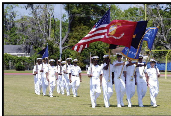
At left, SSU NROTC Midshipmen pass in review during the annual Spring Review on April 16th.