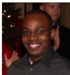
Blue Jacket of the Year: LSSN(AW) Age